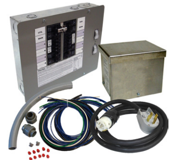
50 AMP Model 6296