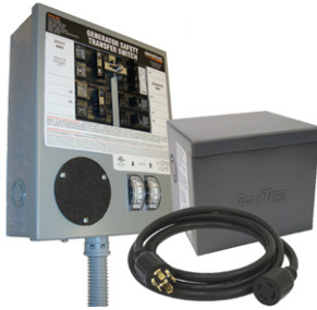
30 AMP Pre-wired Model 6294