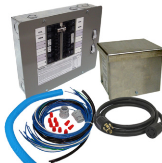
30 AMP Model 6295