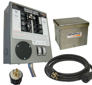
30 AMP Pre-wired Model 6408